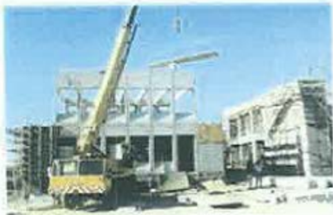
Schools in Kalazanta (works)