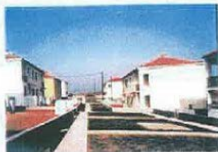
Residences at ZOGRAFOU