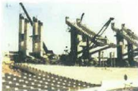
View of part of the works at Olympic Stadium

This project, one of the most difficult ever made in Greece, was accomplished successfully within the time limit.