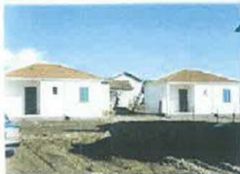
Residences for earthquake victims at Kozani