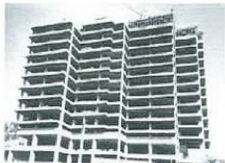
Extension of the hospital E.E.S.