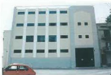
Building of offices