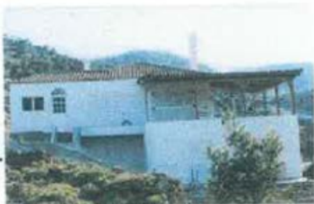
Luxurious countryside residence