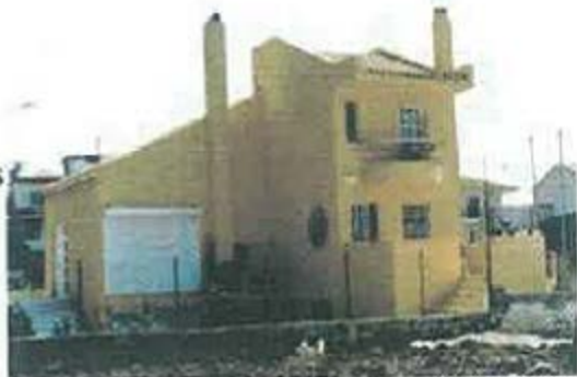
Luxurious residence built with the prefabrication system of KAISER OMNIA