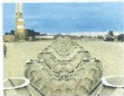
Arrangement of the moulds for the fabrication of blocks of concrete in JUBAIL.

Client ARCHIRODON S.A. ARCHIRODON S.A. HYUNDAI Co. BALFOUR BEATTY COSTAIN ADRIAN VOLKER