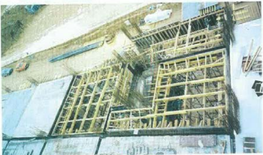
AIRPORT EL. VENIZELOS NOVEMBER-DECEMBER 2000