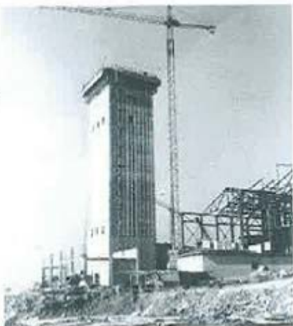
View of Greek Glass Making factory