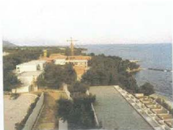
View of touristic village CLUB MEDITERRANEE