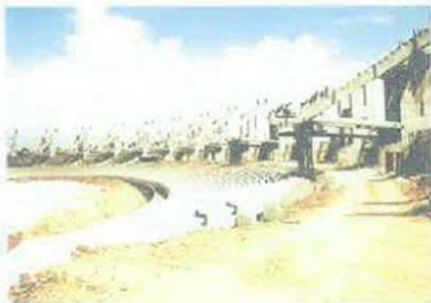
General view of the works at the Olympic Stadium.