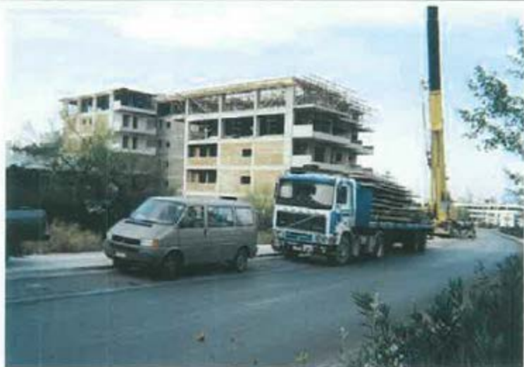
BLOCK OF FLATS AT GLYFADA 1999