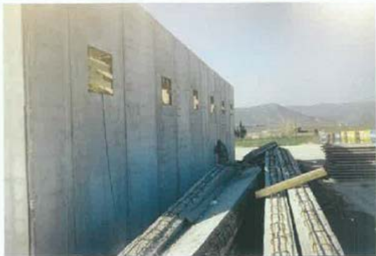
STORAGE HOUSES FOR MAC BETON AT THIVA 1998