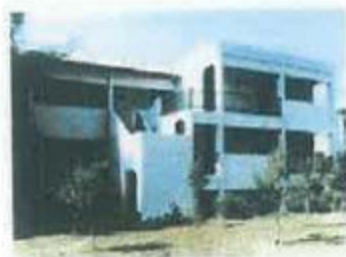
CLUB MEDITERRANEE, View of bungalows

Establishment of the company "GROUP L. PAPAECONOMOU LTD" specialised in the construction of prefabricated materials .