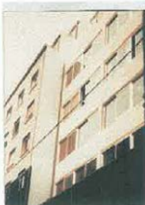
Building of offices Amintou Gkika