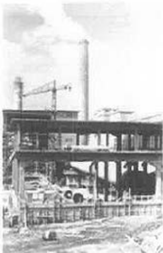
Factory of A.G.E.T. IRAKLIS in Drapetsona