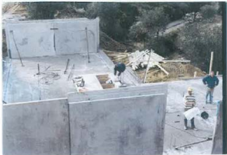
3-STOREY BUILDING AT SKIATHOS IN 1997