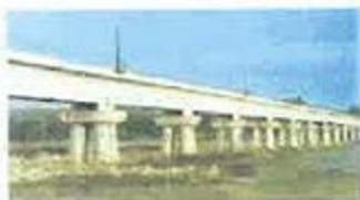
Bridge of Arda

The company "TECHNOHELLENIC LTD." is established and undertakes the construction of two rail bridges for the account of O.S.E.(Greek Railways):