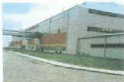
Views of the sugar factory