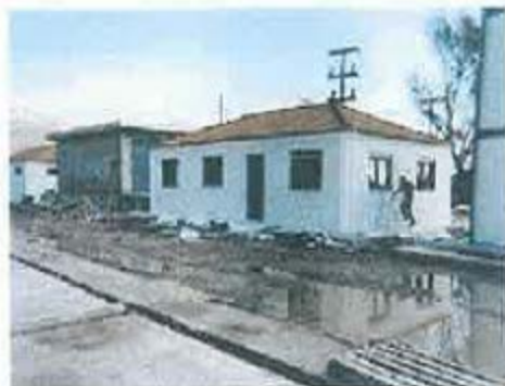
Buildings for the factory of KALAS in Messolougli

During this year, the company undertook the construction of buildings for the following clients: