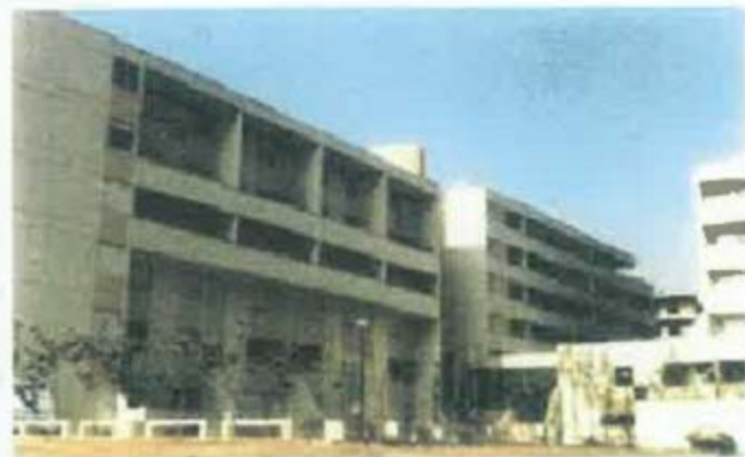
Views of the housing estate KAKKAVA