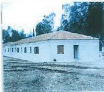
Residences at Hellinikon

The association between KAISER-OMNIA and N.Papadakis resulted in the construction of residences and buildings for the account of G.E.A. at the following military airports: