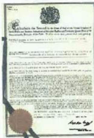
The diploma patent of the British Office of Patents

This year 2 application forms are filled out for request of diploma patent at the British Office of Patents concerning: