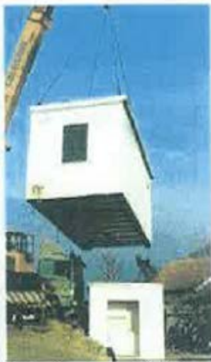
Residence for earthquake victims-insitu assembly