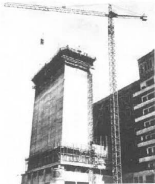
View of the construction of the Silo for the flour industry "MILLS AG, GEORGIJOU"