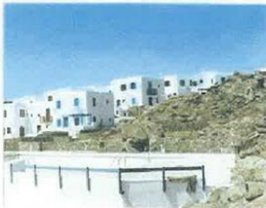
Touristic village at Mykonos

Construction of a building of offices in the center of Athens.Total surface of 1600m 2 .