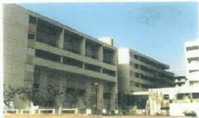
Views of the housing estate KAKKAVA.