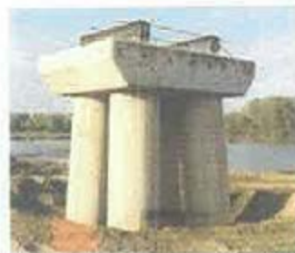
Pylon of Arda bridge