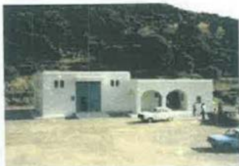
barn of Andros