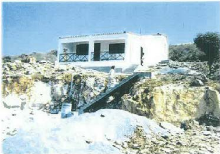
HOUSE OF KAVALIANI IN MAY 1999