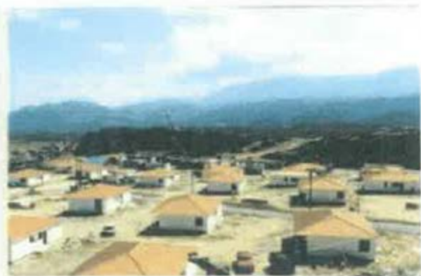
General view of the settlement for D.E.H.