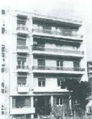
Block of flats at Zografou